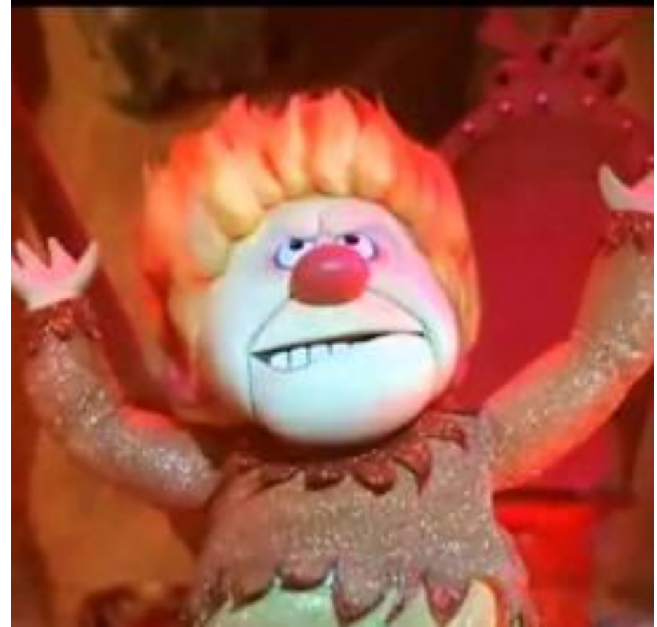
Heat Miser The Year Without a Santa Claus, 1974