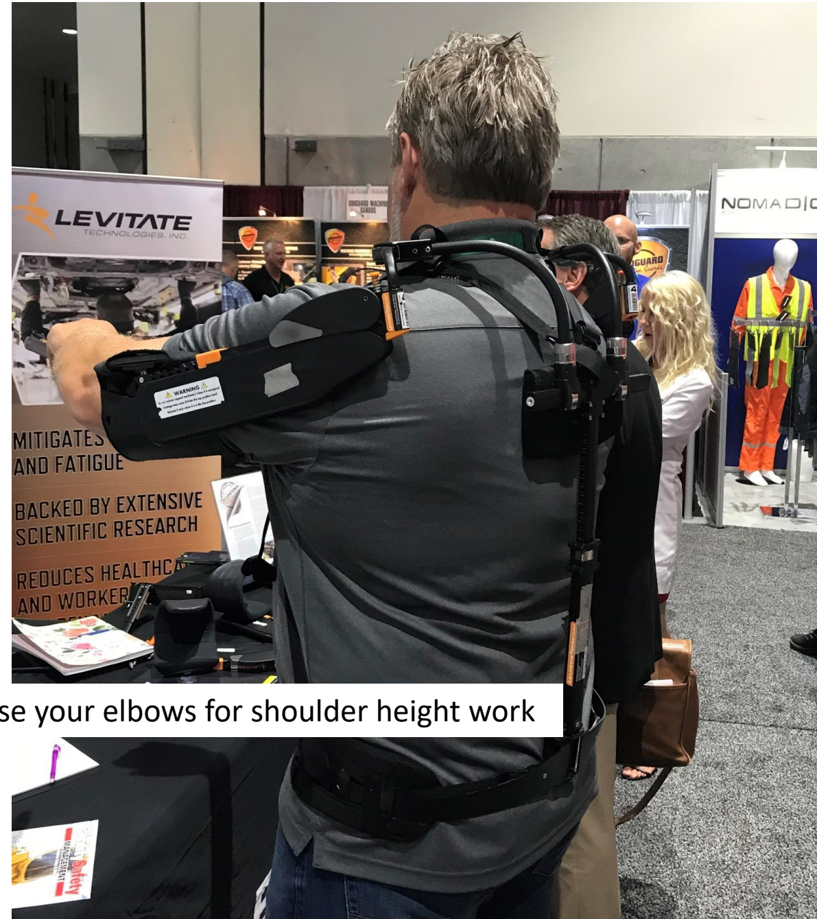
Lift assist exoskeleton – provides pneumatic assistance when you raise your elbows for shoulder height work